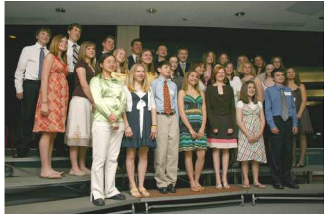
Herrick Middle School Honorees

April 24th marked a very special night for 58 eighth-graders in Downers Grove Grade School District 58, along with their proud families and teachers, as they were honored at the annual Select 58 banquet sponsored by the Education Foundation.