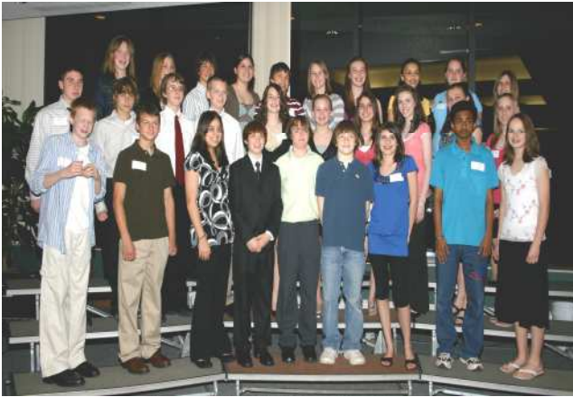
O’Neill Middle School Honorees